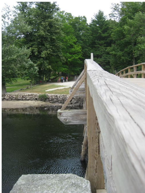
The North Bridge in Concord, MA as seen through the camera lens of Ian Smith.